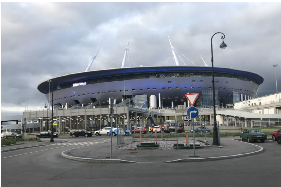
Football Stadium, St. Petersburg, 3. August 2019