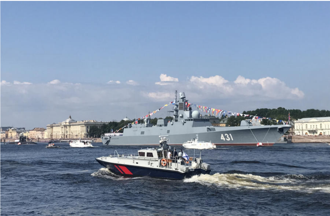
Navy parade, St. Petersburg, 28. July 2019